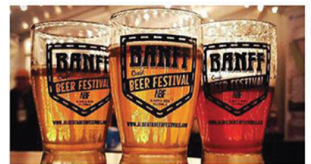
Banff Ave Brewing Co

take a relaxing soak at the Banff Upper Hot Springs then head out to the Banff Ave Brewing Co for an evening of beer flights and great local food.