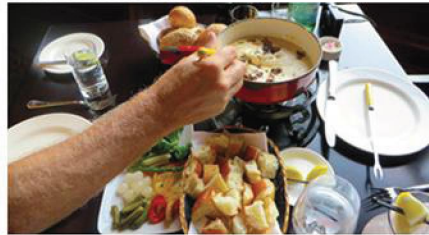
Fondue at Walliser Stube Restaurant

next two nights in Lake Louise, this evening we recommend The Station Restaurant located at the Heritage Railway Station, enjoy great food in this historic setting.