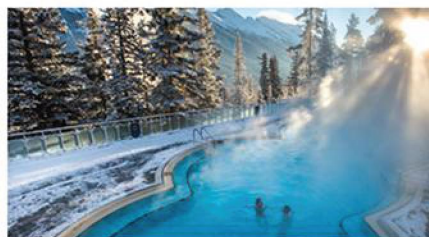
Banff Upper Hot Springs

The day is yours to enjoy, go dogsledding, go ice skating on Lake Louise, ride the Lake Louise Gondola, take a sleigh ride, eat the best fondue ever at the Walliser Stube Restaurant located at the Fairmont Chateau Lake Louise.